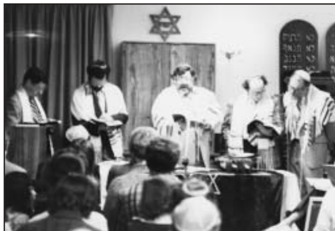
A “Hebrew Christian” congregation in Toronto uses an authentic Torah scroll at their “Shabbat service”.

It is tragic that too many Jews are unaware of the profound meaning and spirituality within their own faith.