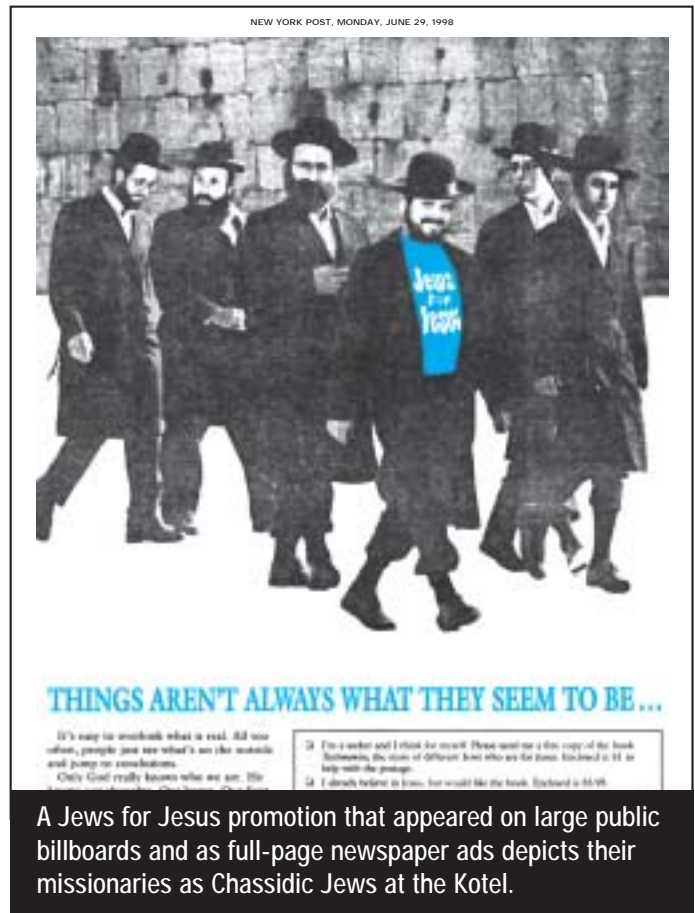
A Jews for Jesus promotion that appeared on large public billboards and as full-page newspaper ads depicts their missionaries as Chassidic Jews at the Kotel.

Today’s missionaries promote the deceptive message that “It’s Jewish to believe in Jesus.”